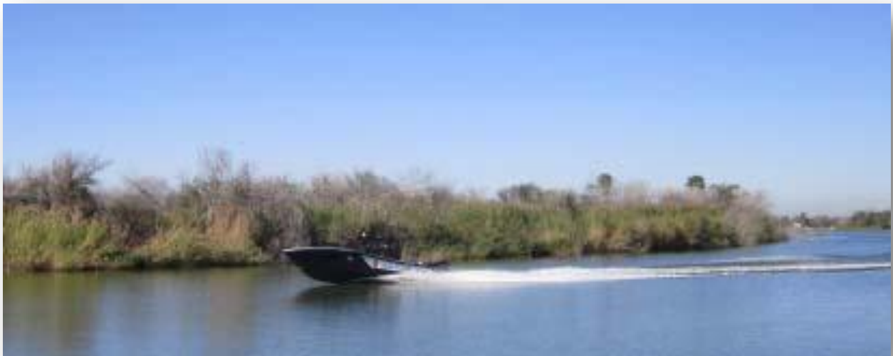
Public Safety Commissioners aboard DPS Tactical Marine Unit on the Rio Grande